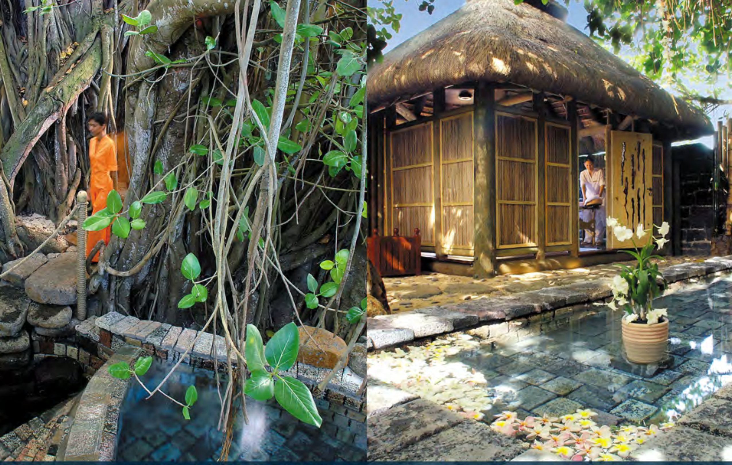
Take the stone steps to wellness high in the branches of a banyan tree