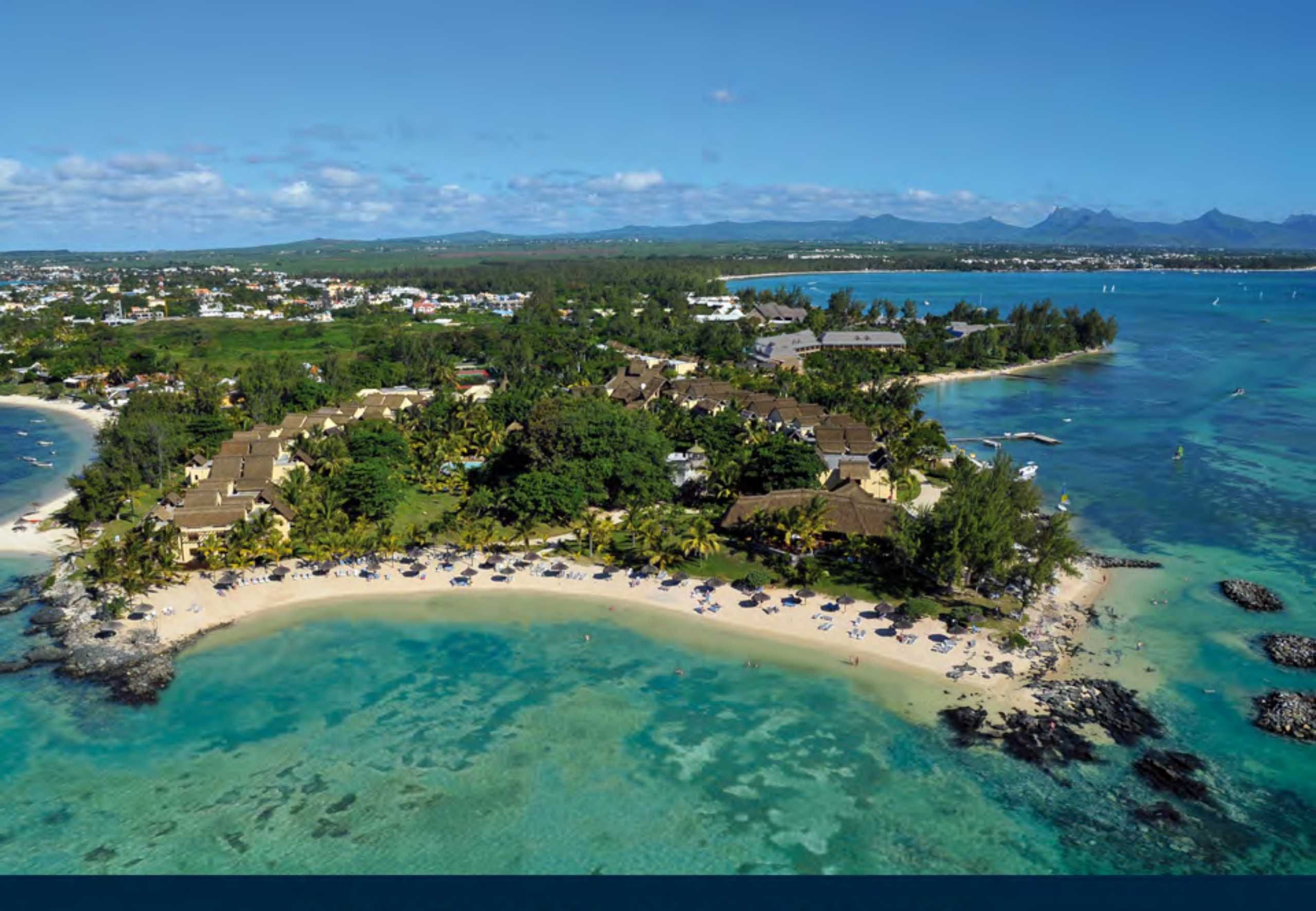
A perfect crescent moon hugs a sheltered bay