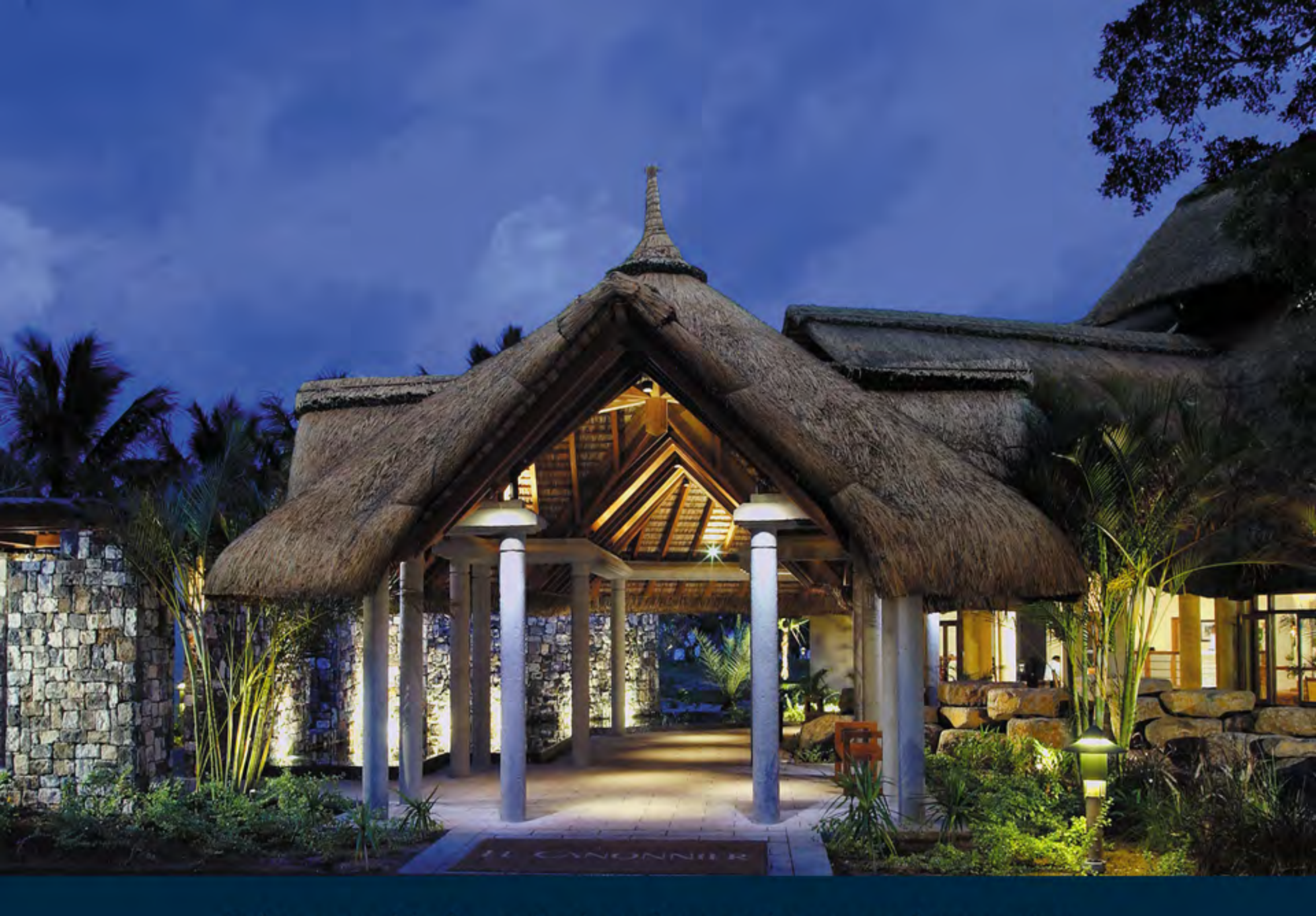
Enter a world of magical mystery and prepare for surprises