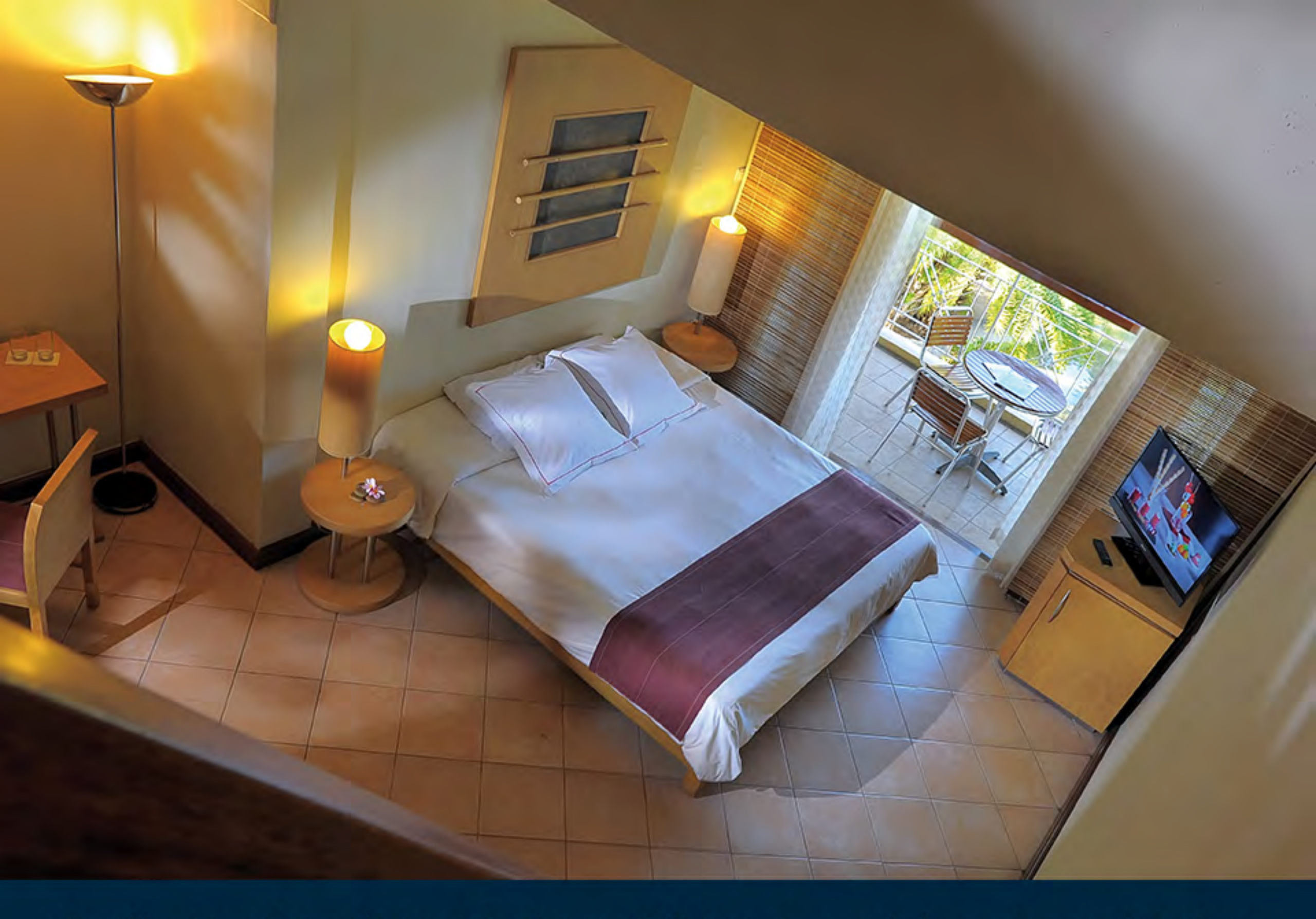
Families love the split level duplexes. Children stay upstairs and parents below