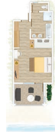
Deluxe Sea Facing Room