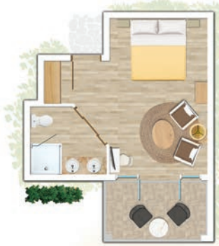
Standard Garden Facing