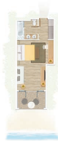
Superior Garden / Superior Sea Facing