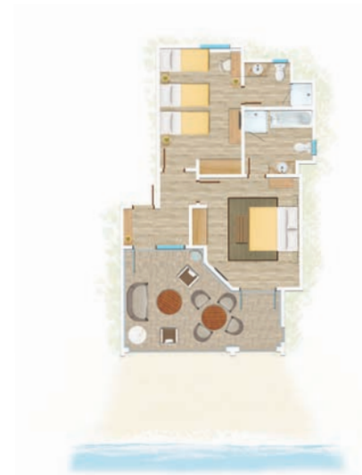
2-Bedroom Garden Facing Apartment