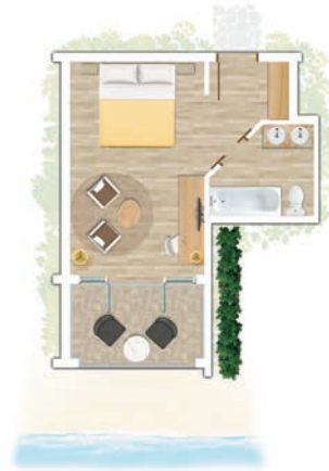
Standard Sea Facing