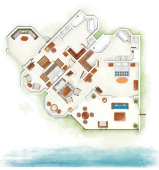
2-Bedroom Luxury Family Suite