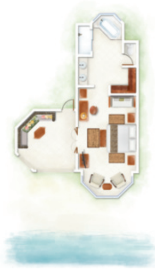
Junior Suite / Junior Beachfront Suite / Zen Suite / Zen Beachfront Suite