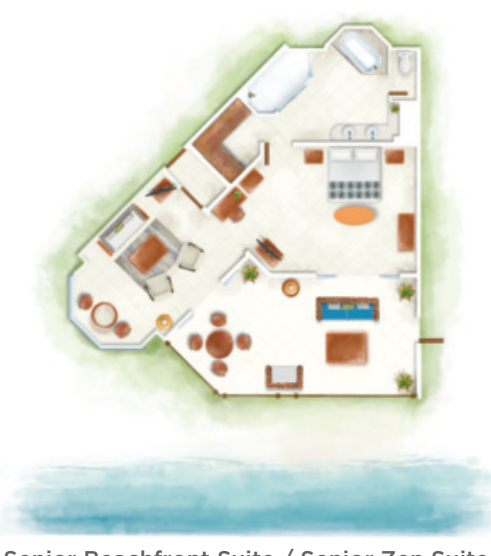
Senior Beachfront Suite / Senior Zen Suite