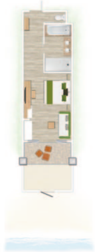
Superior Room / Superior Beachfront