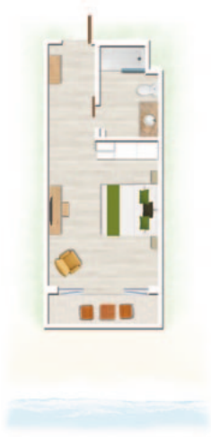
Standard Room / Standard Beachfront