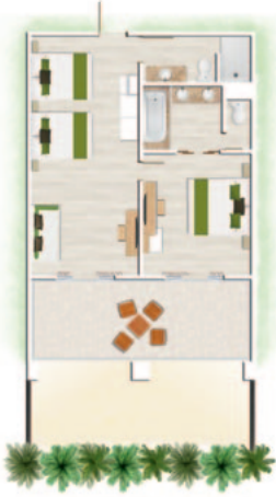
2-Bedroom Garden facing Apartment