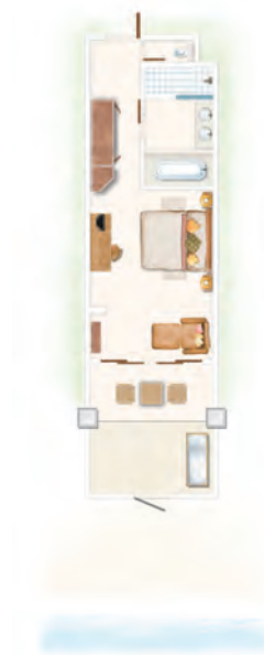
Superior room categories