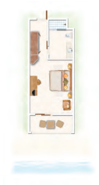
Standard room categories