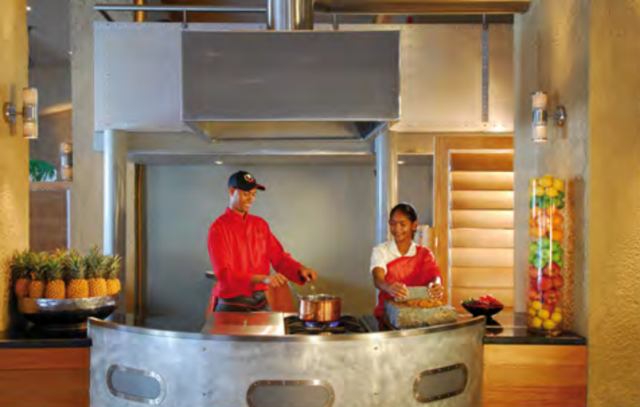
Delicious island flavours please the palate