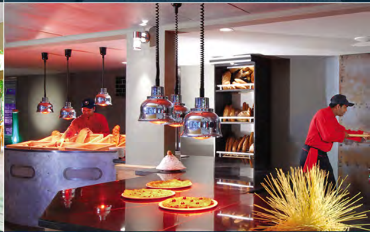
Live cooking adds entertainment to eating at Les Quais