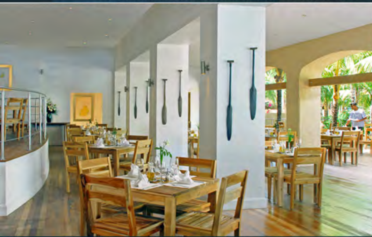
Modern décor sets the seafood scene