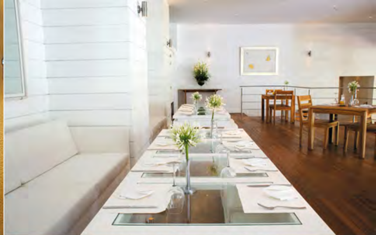
White nights and fresh fish at Le Nautic