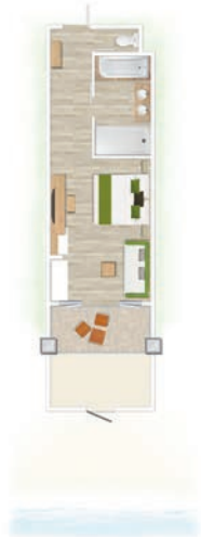
Superior Room / Superior Beachfront