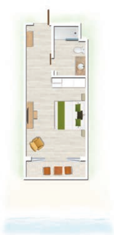
Standard Room / Standard Beachfront