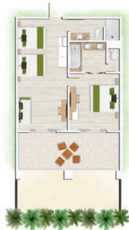
2-Bedroom Garden Facing Apartment