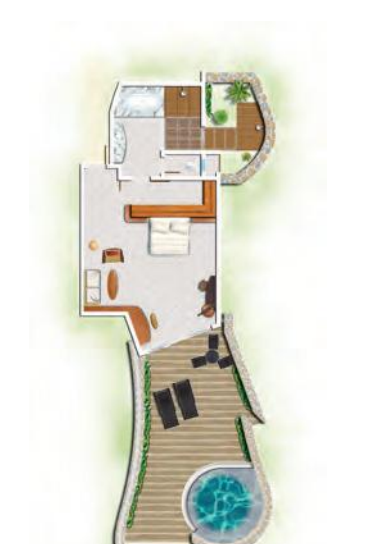
Beachfront Suite with pool