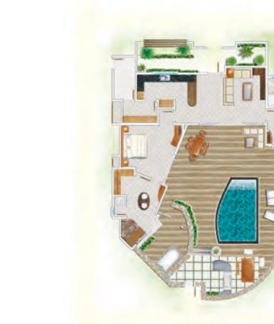
VILLA 2 rooms