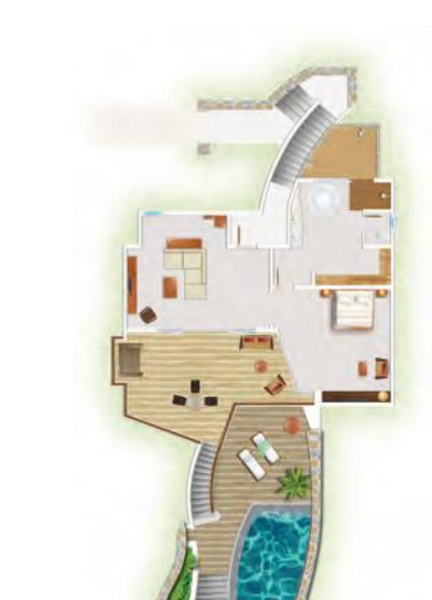
Senior Beachfront Suite with pool