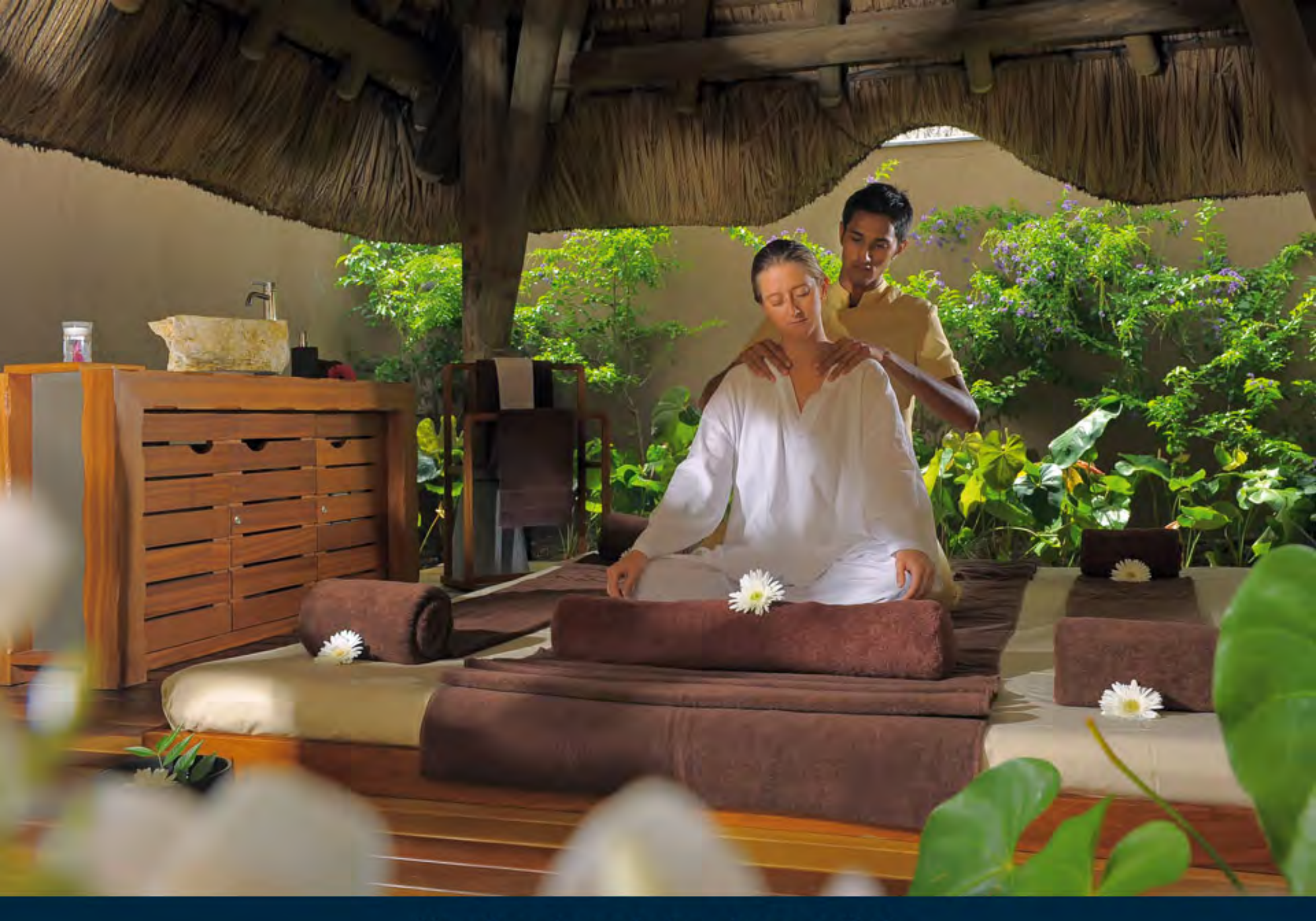
Healing hands for stress relief