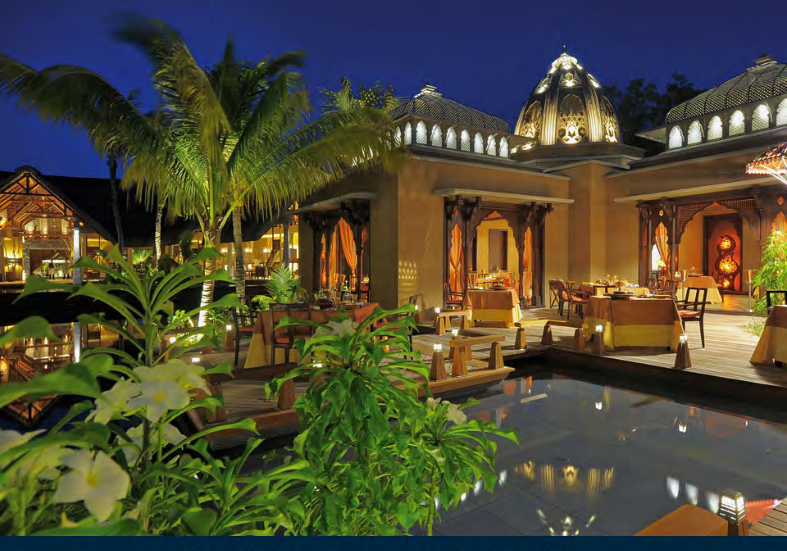
The authentic flavours of India at Mahiya