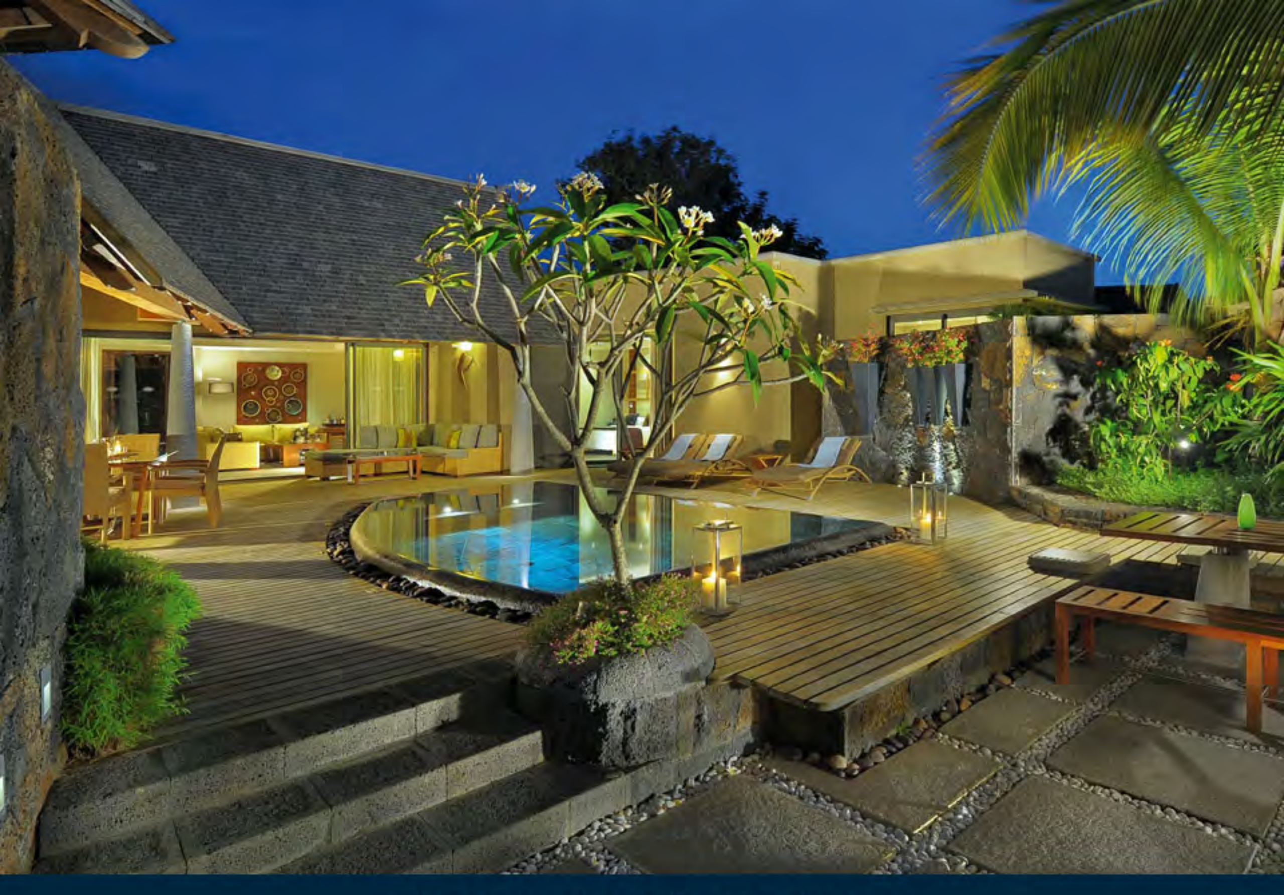
Hide away in a villa for privacy