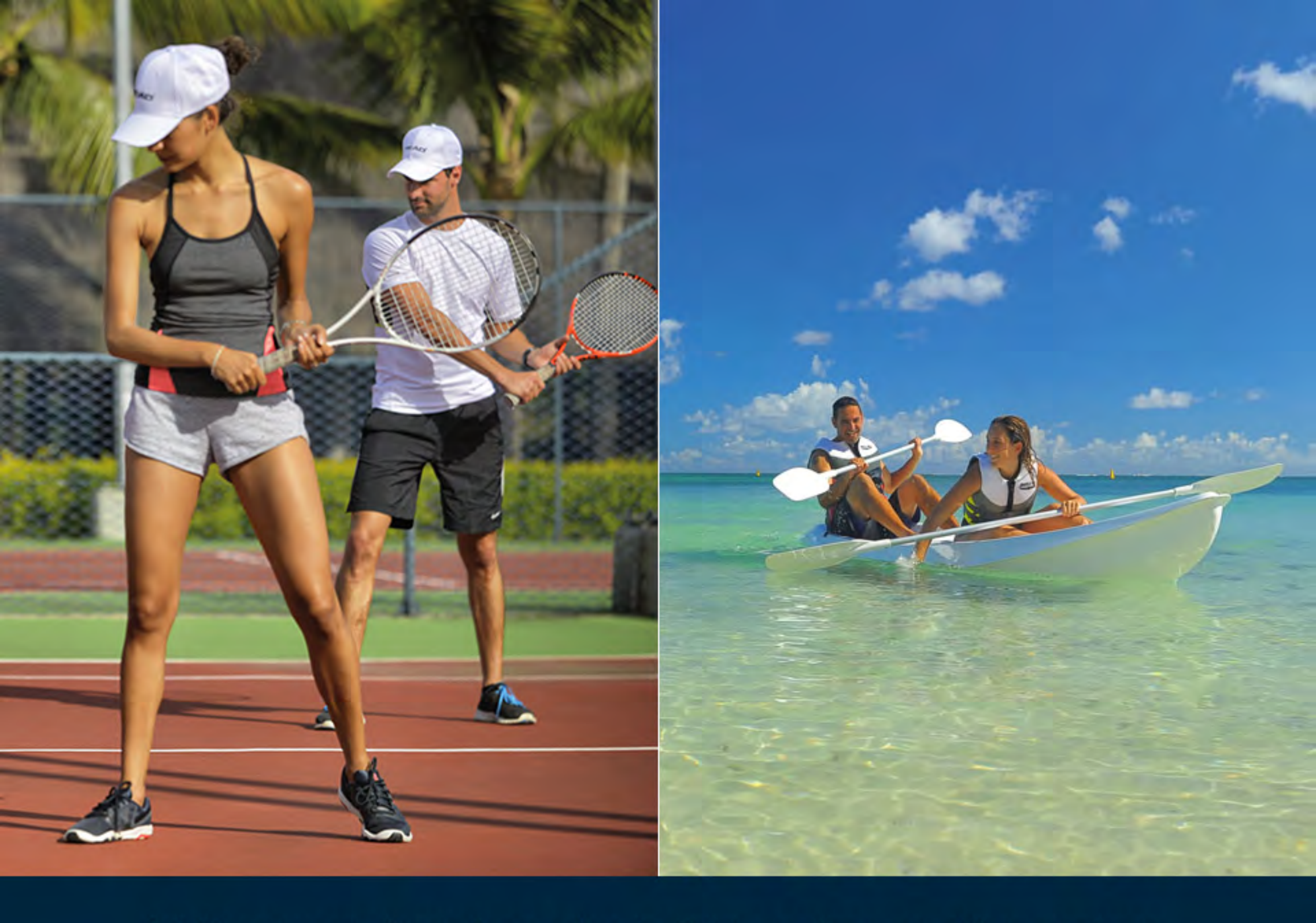
Idyllic surroundings for active holiday makers and fun-seekers