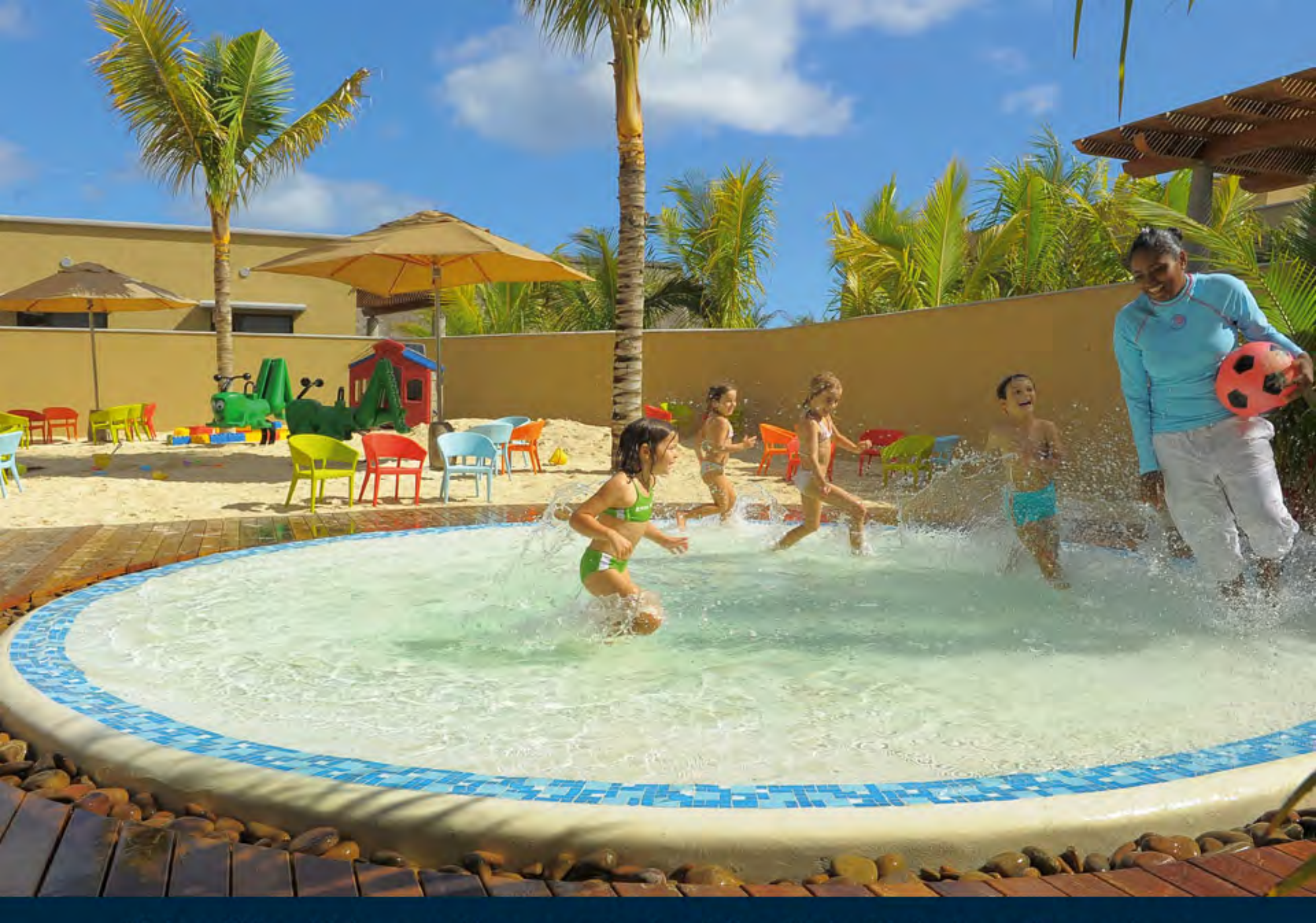
Kids will be kids - making a splash at the Kids Club Beachcomber