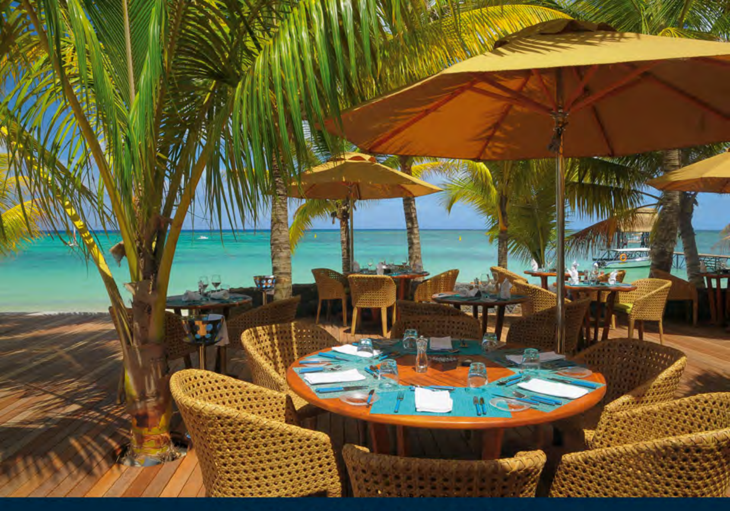
A snack next to the sea at Le Deck