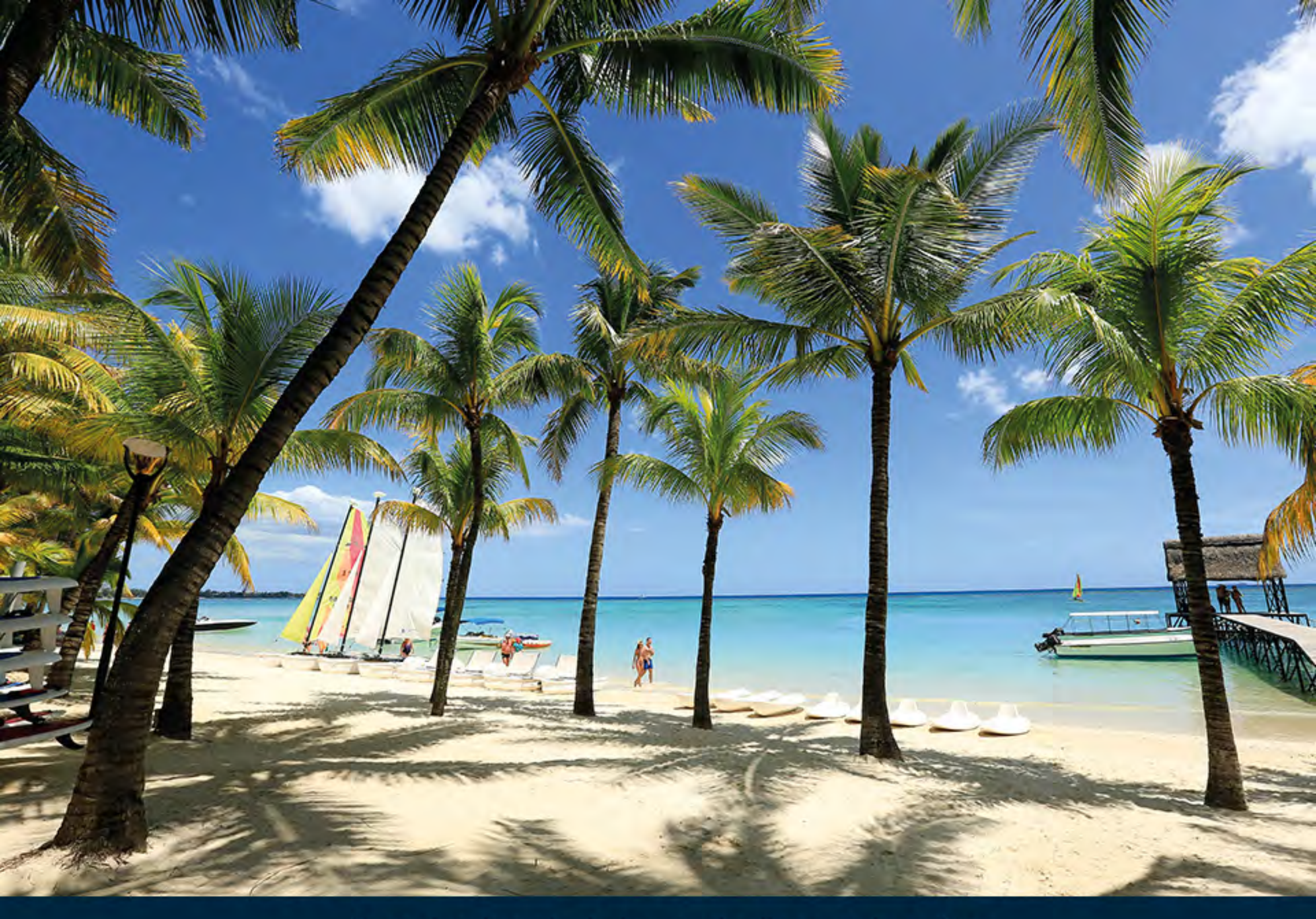
Read a book, take a stroll or get active