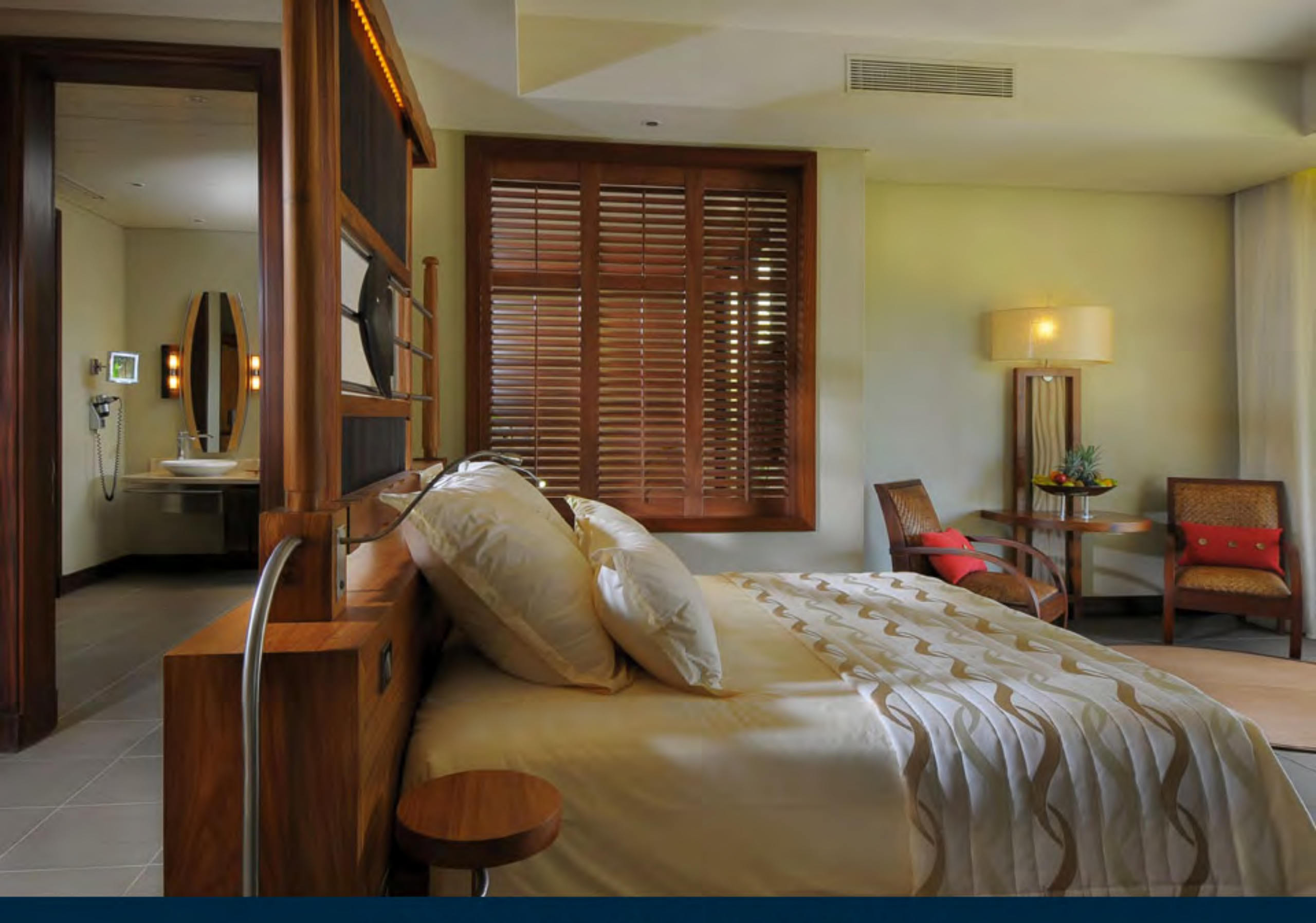
A cool spot to rest your weary head