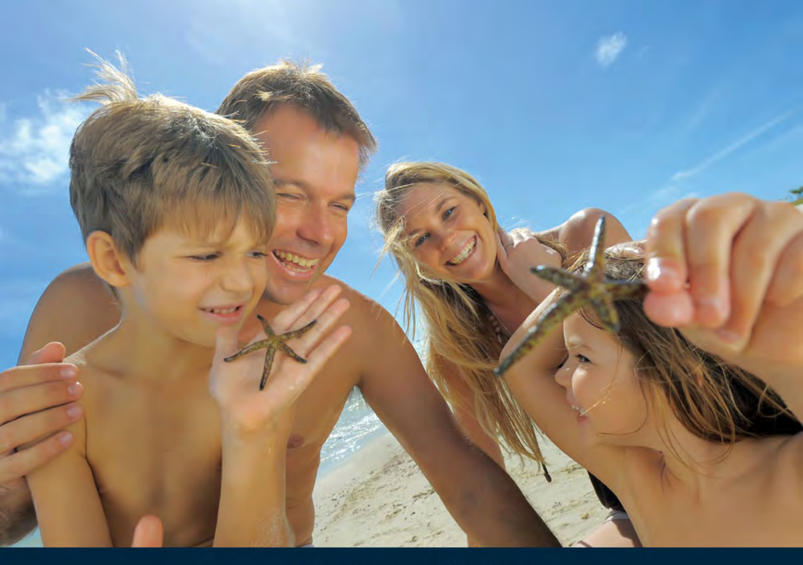
Family fun all day long