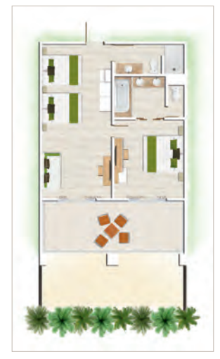
2-Bedroom Garden Facing Apartment