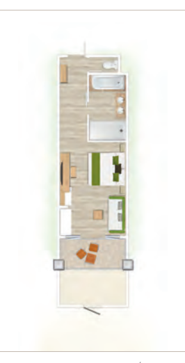
Superior Room / Superior Beachfront