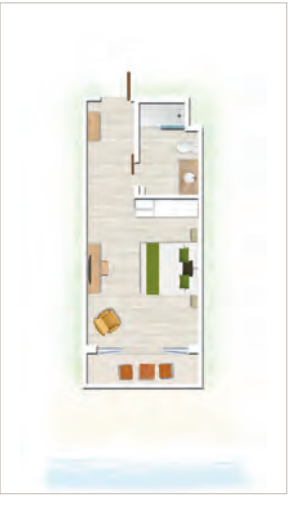
Standard Room / Standard Beachfront