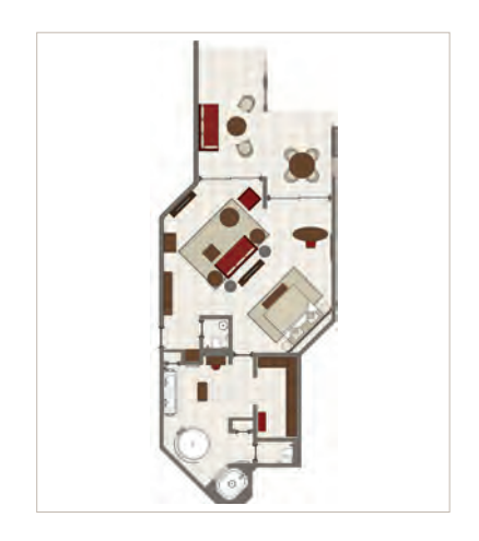
Palm Suite (layout differs for families)