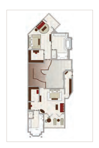
Royal Suite - First Floor