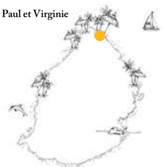
Veranda Paul et Virginie

Nestled in the quaint fishing village of Grand Gaube, this adults-only hotel is the perfect spot for couples looking for an intimate and quiet cocoon, with unique activities and experiences to discover the region.