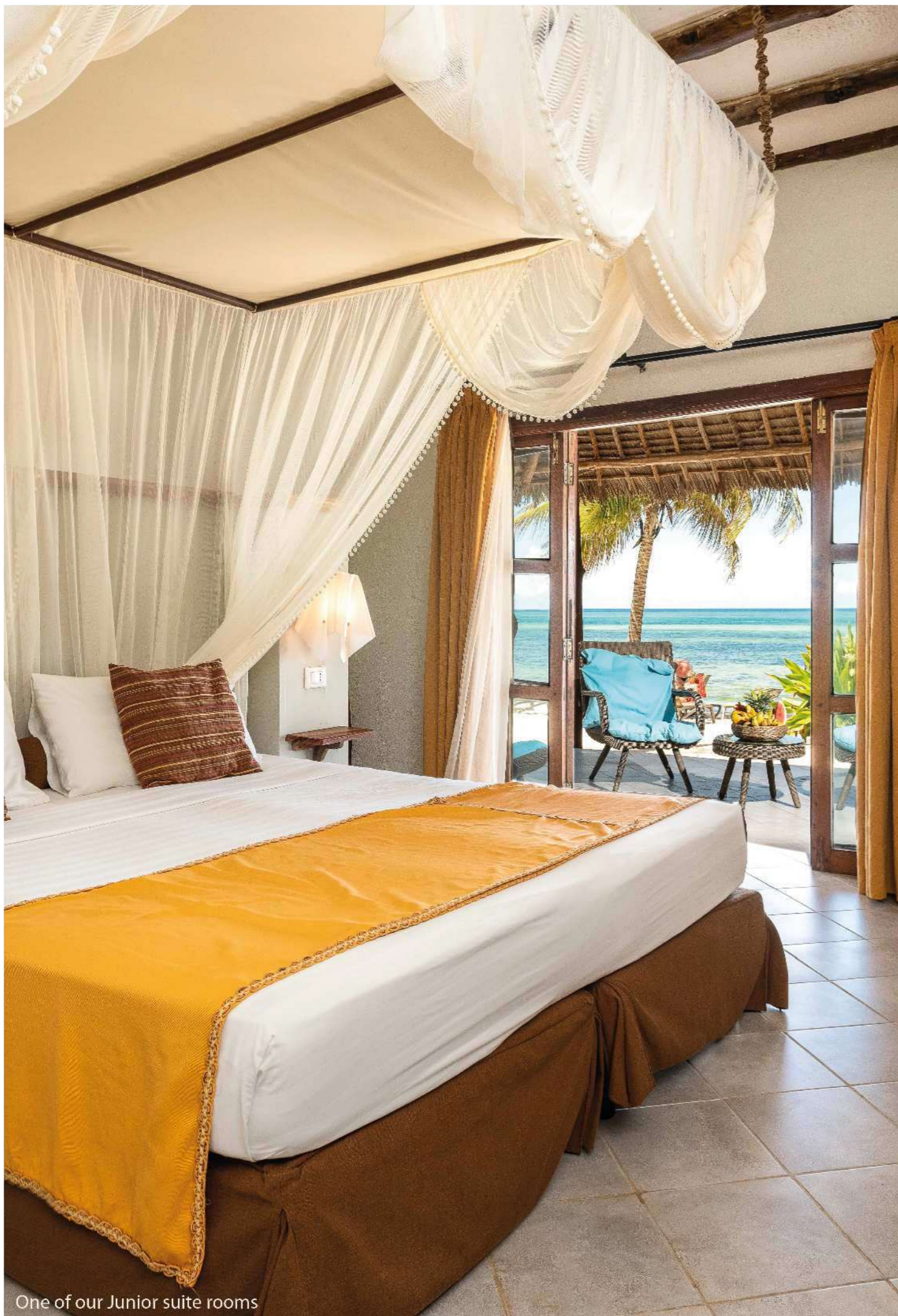
One of our Junior suite rooms