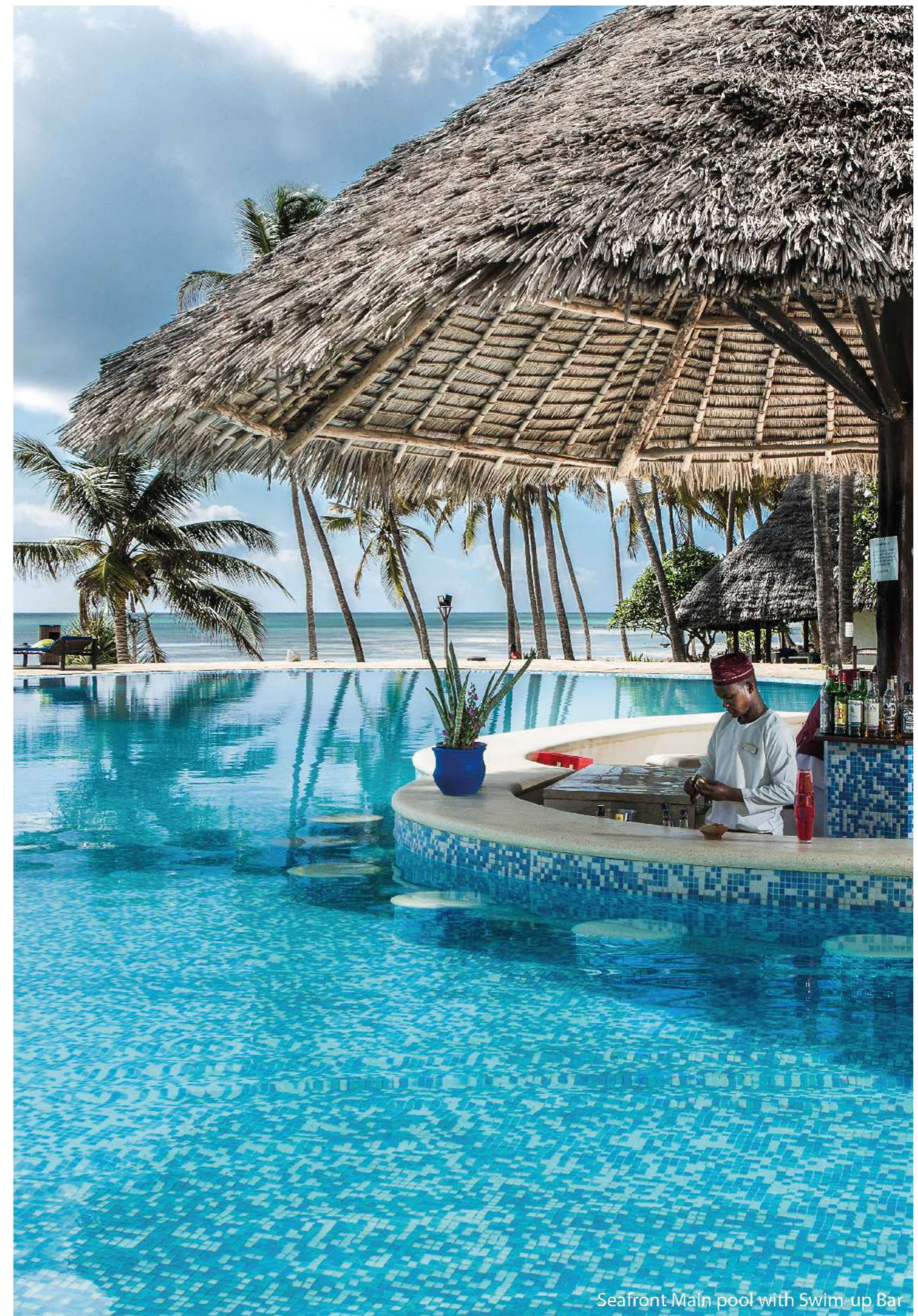
Seafront Main pool with Swim-up Bar