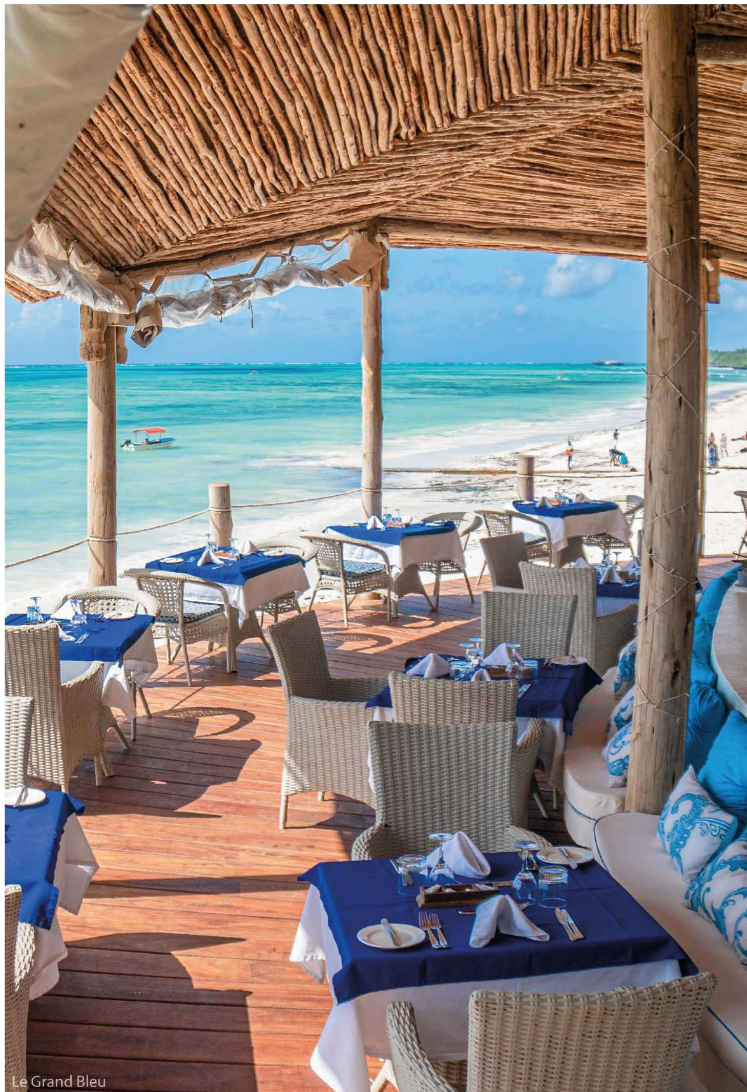
Le Grand Bleu