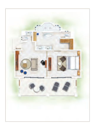
Paradis Suite Beachfront