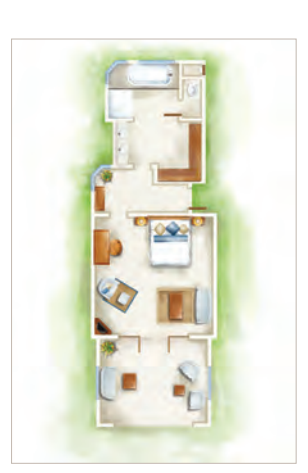
Junior Suite / Junior Suite Beachfront / (2 interleading make up the Family Suite version)