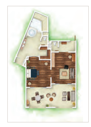
Senior Suite Beachfront