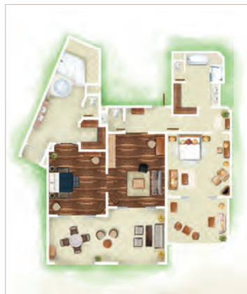
2-Bedroom Senior Family Suite Beachfront