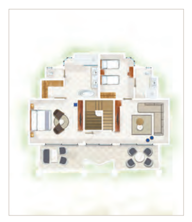
2-Bedroom Paradis Luxury Family Suite Beachfront