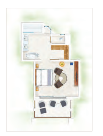
Paradis Bay Facing