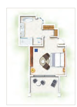
Paradis Beachfront / (2 inter-leading make up the 2-Bedroom Paradis Family Suite Beachfront)