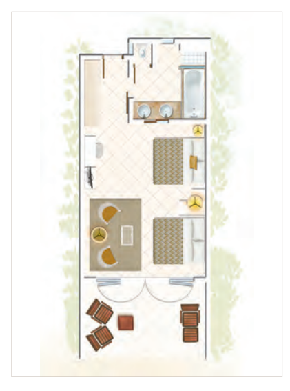
Deluxe Room (Second Floor) / Deluxe Ground Floor