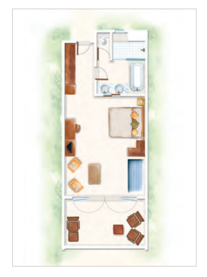
Superior Room First Floor