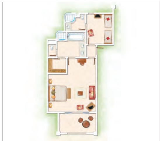
2-Bedroom Family Apartment (First Floor) / 2-Bedroom Family Apartment (Ground Floor)