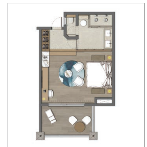
SHANDRANI FOR 2 Bay-Facing Rooms / Beach- Facing Rooms