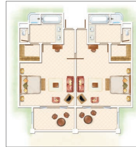
2-Bedroom Deluxe Family Apartment (2 interleading rooms)