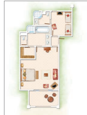
2-Bedroom Family Apartment (First Floor) / 2-Bedroom Family Apartment (Ground Floor)