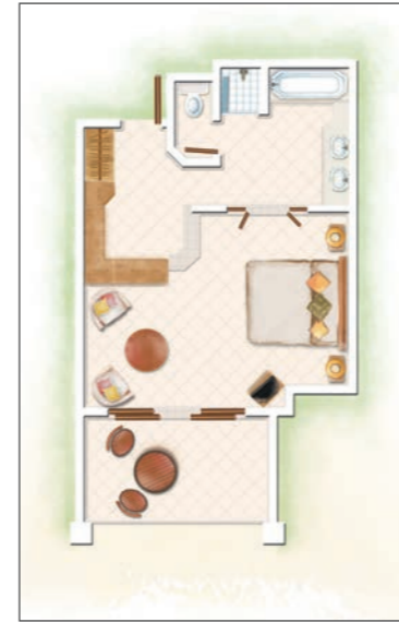
Tropical Room (Upper Floor) / Tropical Room (Ground Floor)