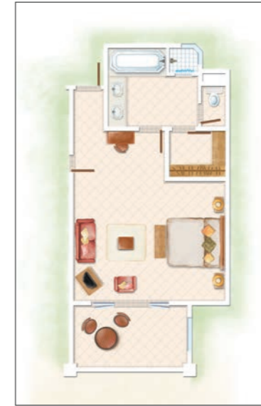
Deluxe Room (Upper Floor) / Deluxe Room (Ground Floor)