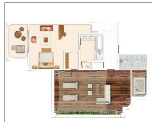
Rooftop Deluxe Room